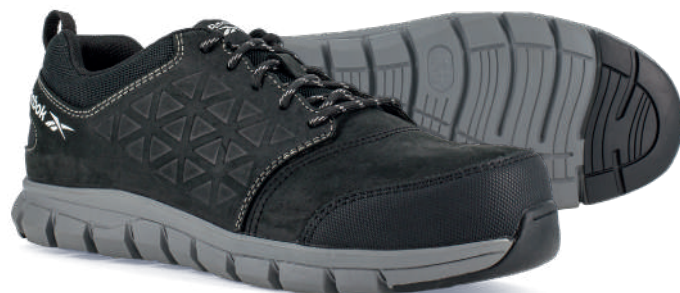
IB1036S3 EXCEL LIGHT SAFETY

EN 20345 ALUMINIUM ALLOY TOE S3 ANTI STATIC SRC