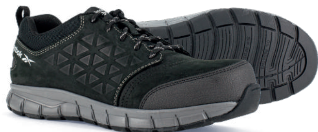
IB1036-IS3 EXCEL LIGHT SAFETY

EN 20345 ALUMINIUM ALLOY TOE S3 ANTI STATIC SRC