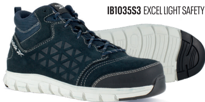
IB1035S3 EXCEL LIGHT SAFETY

EN 20345 ALUMINIUM ALLOY TOE S3 ANTI STATIC SRC