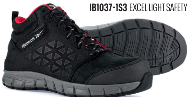
IB1037-IS3 EXCEL LIGHT SAFETY

EN 20345 ALUMINIUM ALLOY TOE S3 ANTI STATIC SRC